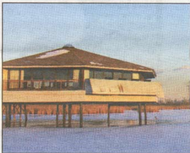
IN A SEA OF WHITE: Visitors' center at sunset.

dove" is actually a more poetic name for a pigeon. The ornithological, Latin name for a pigeon is "Mus avis," or "flying rat." (OK, we made that up.)