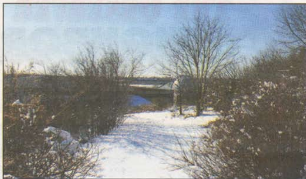
SNOWY HAVEN: DeKorte Park is a delight even in winter.

Still, if you bundle up properly, you can enjoy the beauties of the park, with its trails and icy vistas stretching to the horizon and Manhattan's towers. It is open daily,