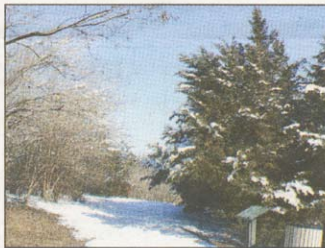
VIEW FROM THE TOP: Nature trail looks down upon visitors' center.