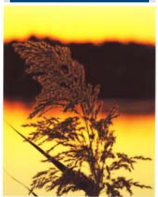
First Place Environment