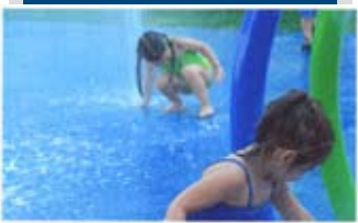
First Place Community